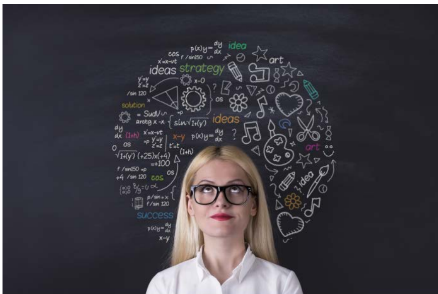
Figure 3 Ideological and political education

In terms of topic selection and editing, teachers can combine practical cases to find points close to students' lives, skillfully popularize good learning methods and efficient problem-solving methods to students, lead students to pay more attention to news and information, legal provisions, national policies, etc., so that students can get a lot of knowledge from daily reading and browsing, and establish a credibility Heart, dare to face up to the problems in learning and life, know how to think in a new way, actively use the limited resources around and seek help from others, cooperation and other ways to solve problems, and gradually get a qualitative leap in thinking.