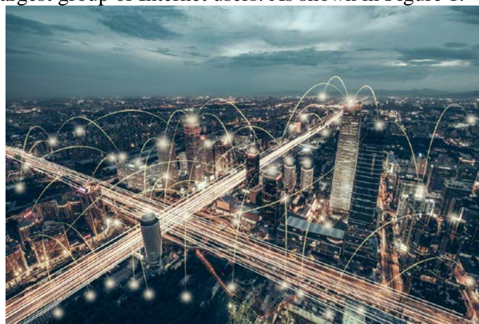
Figure 1 Development of CNNIC's Internet in China

In the era of Internet, the speed of information dissemination is obviously accelerated, and the scope of dissemination is also more extensive, which brings great convenience to college students' daily study and life. Students can access mobile devices anytime and anywhere by connecting to the Internet with mobile phones, iPads and other mobile devices. According to the survey of relevant data, students are the largest group of Internet users. As shown in Figure 1.